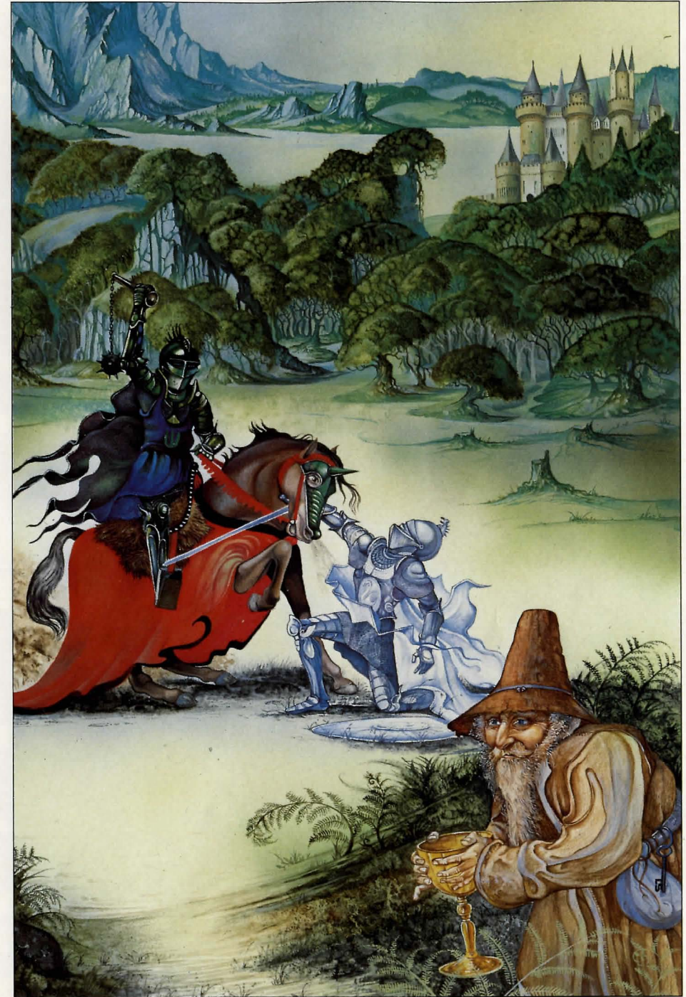
About the bloody colour which has led

One lonely ancient wizard priest, The magic sword's protector at the feast, The holder of the keys where first and last, Can sometimes be reversed in ancient tales – whilst simple minds are trapped in glories past.